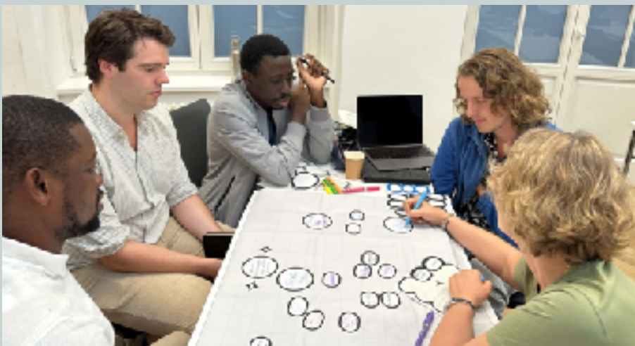
IL3-UB Workshop on Hybrid Learning, at EURIDICE Plenary BiAnnual, Vienna, Sep2024

Hybrid learning and teaching is a major new topic for teaching staff