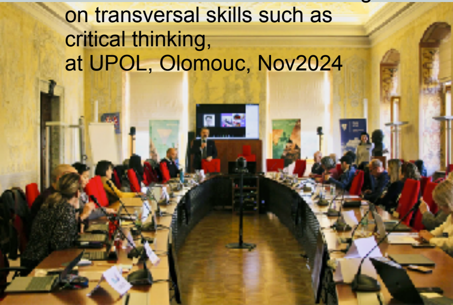
EURIDICE BIP Teacher Training on transversal skills such as critical thinking, at UPOL, Olomouc, Nov2024